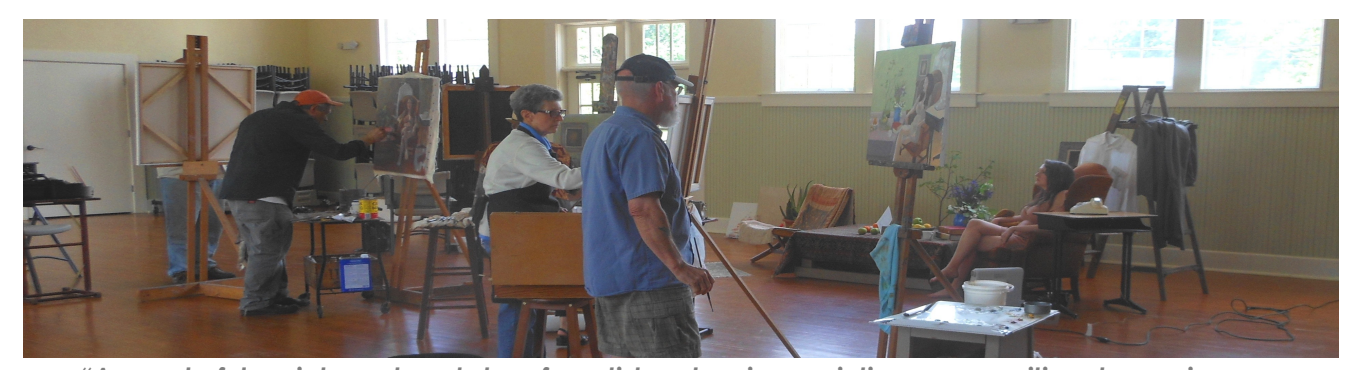
"A wonderful enrichment workshop for artists – drawing, painting, compositional exercises incorporating still life, plein air and figurative lessons along with art history and discussion – highly recommended to artists of all levels!"

May 9 - 13th Light, Life, Atmosphere 9 – 4 Monday - Friday Join us for our expansive painting intensive at the beautiful McKinney Center in Historic Jonesborough.